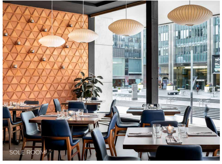
EDNA + VITA Signature Events