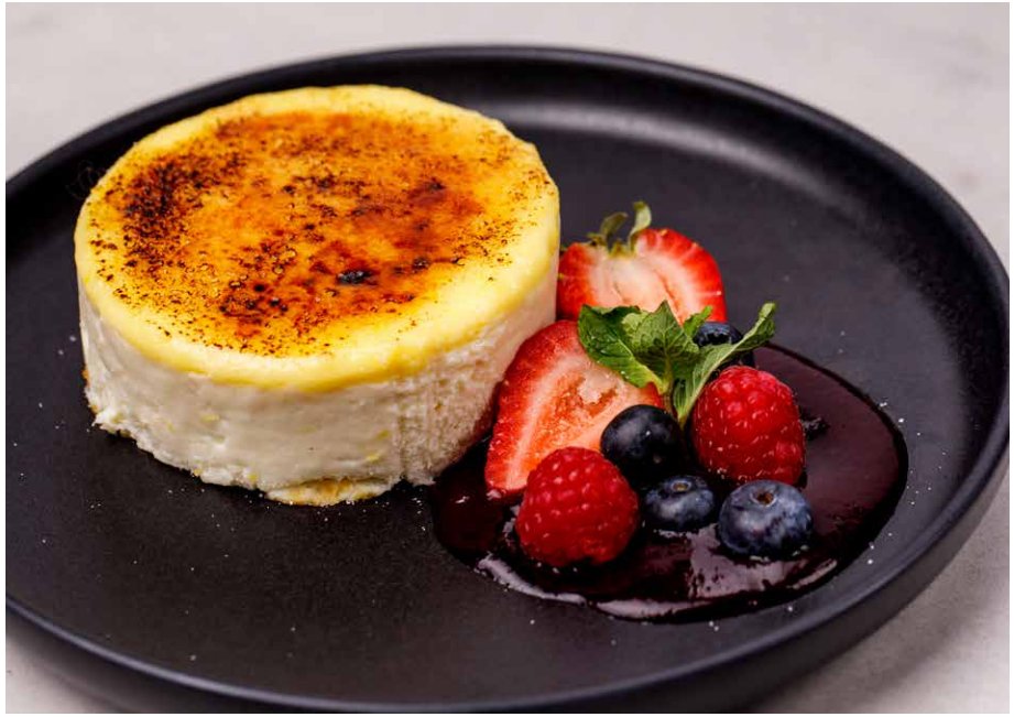
Edna + Vita is not an allergen-free facility and guarantee 100% no trace. Please inform your Event Specialist of any allergies or dietary restrictions in the party. All menus subject to seasonal change.

BOOKINGS: sircorp.com/events/contact-us/